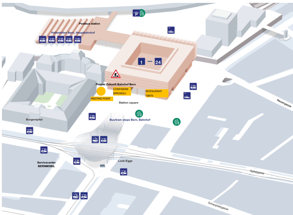
Figure 3: Location of the meeting point for the City Tour.

There, take the escalators / stairs that take you to the ground floor. On your right hand-side you will find the “Confiserie Sprüngli” and on your left-hand side the restaurant “Tibits”. Turn to the right and find the meeting point.